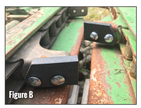
Right Hand Gathering Chain with Poly Paddles