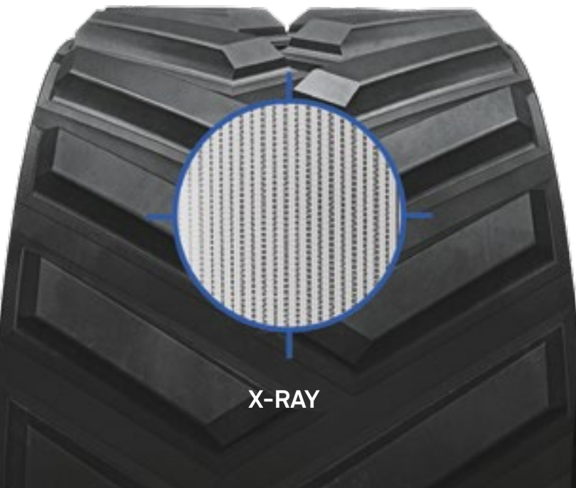
CAMSO'S UNIQUE SINGLE CURE PROCESS