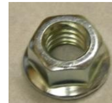
LAN 3718 (2)*