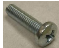
LAN 001AB18A32 (2)*